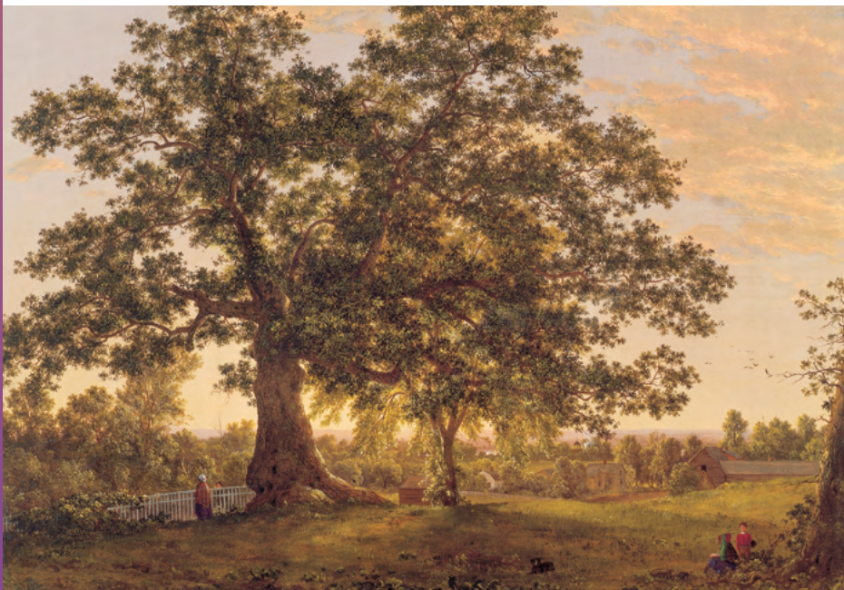
Frederic E. Church, The Charter Oak at Hartford , ca. 1846. Oil on canvas. Gift of The Hartford Steam Boiler Inspection and Insurance Company